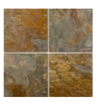
Le Pietre Selection of Stone