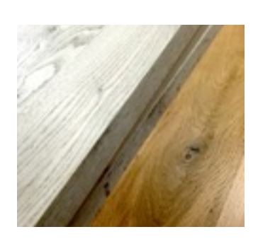
i Legni Selection of Wood