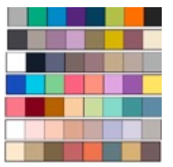
I verniciati Selection of color RAL